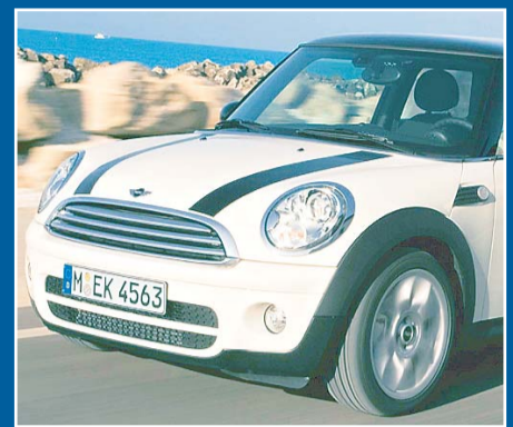
HOT: Mini Cooper D is the first diesel version

Finally, here's a car which shows what they can do when they're allowed to have fun.