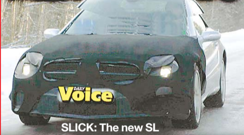
SLICK: The new SL

MERCEDES is looking to strengthen its already strong line-up with an update of the SL for 2009.