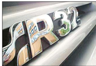
SNAZZY: Golf's rad branding

On the whole, it's a very sporty, sleek and safe car.