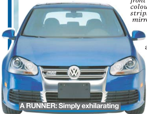
A RUNNER: Simply exhilarating

Sitting 20mm lower than a standard Golf and resting on