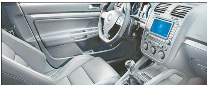
RACY: The interior is tarted up Golf but it's still a nice place to be

Luggage space is pretty good. And with the split-folding seats down, the R32 could be the world's fastest courier van.